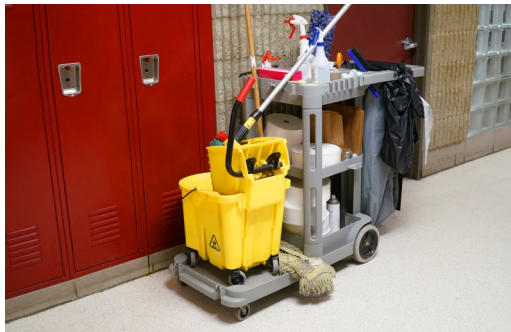
Follow your school's standard procedures for routine cleaning and disinfecting.

Disinfecting kills germs on surfaces or objects. Disinfecting works by using chemicals to kill germs on surfaces or objects. This process does not necessarily clean dirty surfaces or remove germs, but by killing germs on a surface after cleaning, it can further lower the risk of spreading infection.